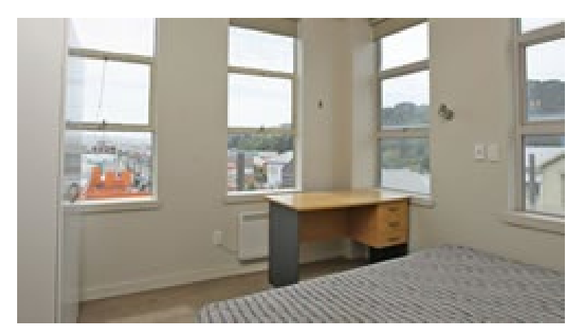
Typical Room layout 1,2,3