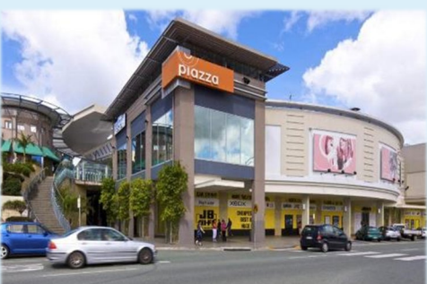
Hyperdome Shopping Centre