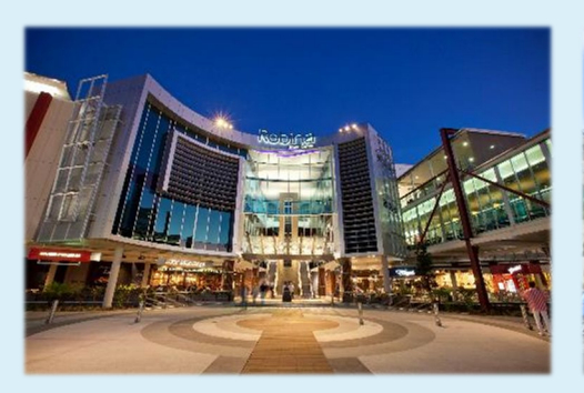
Robina Town Shopping Centre