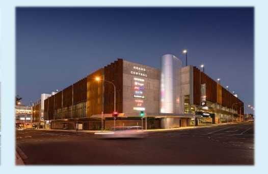
Grand Central Shopping Centre