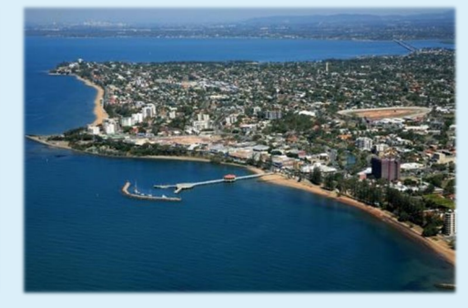
Moreton Bay Council Moreton Bay